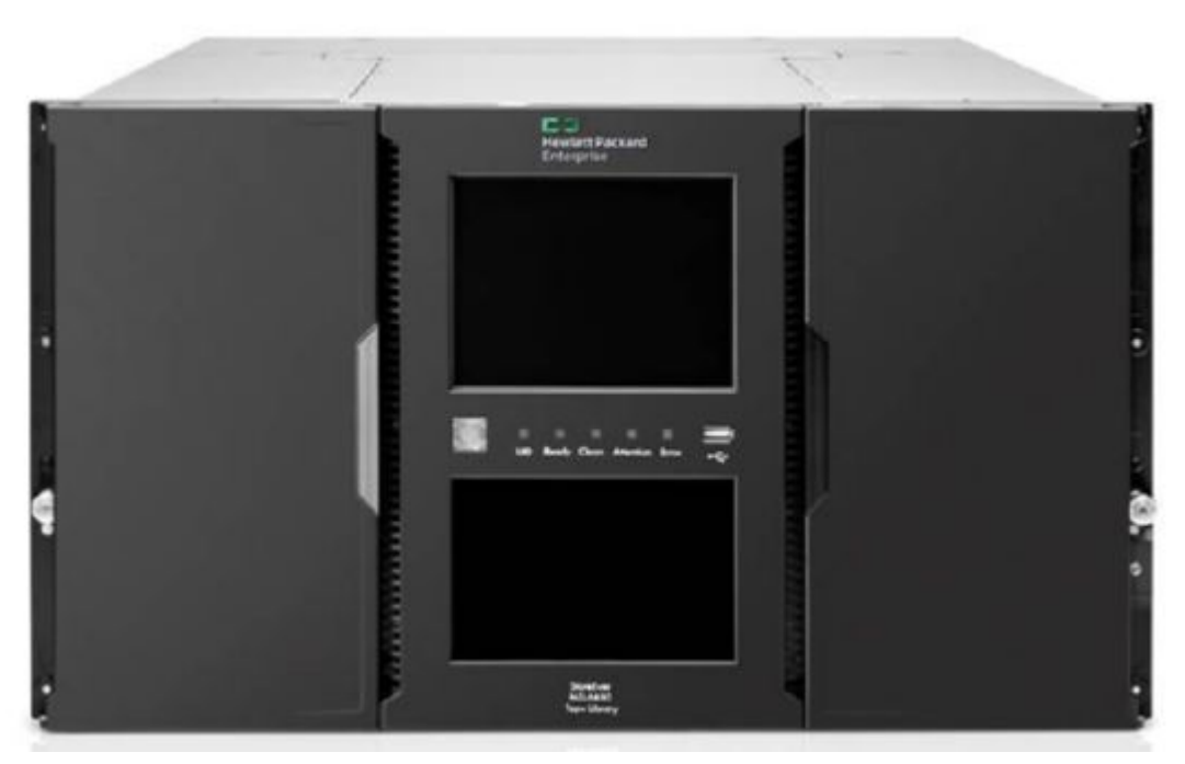
HPE StoreEver MSL6480 Tape Library

HPE StoreEver MSL6480 Tape Library Industry leading scalability - from an 80-slot Base Library Module to 560 slots in a 42U Rack with the addition of up to 6 Expansion Modules